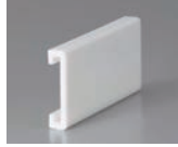
EPASW C650 2 to 4M