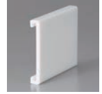
EPASW C690 2 to 4M